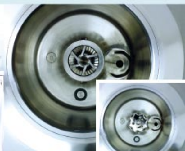
Versatile agitation in the bowl (rotor/estator or blades).