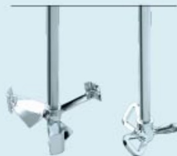
Tripale profilée bidirectionnelle