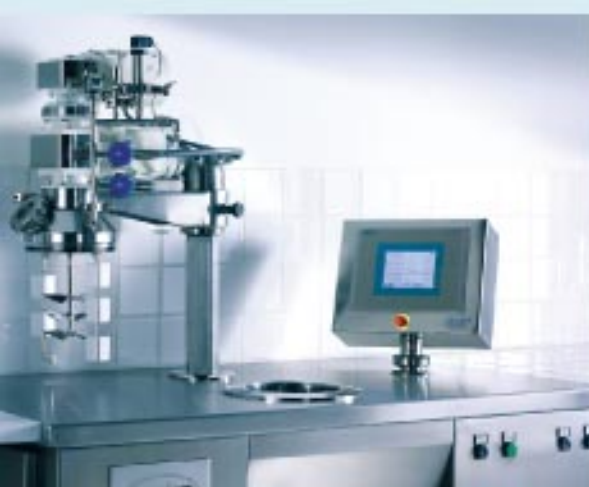
Trilab in loosened position.