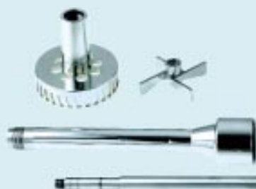
Dismantlable set for cleaning purposes