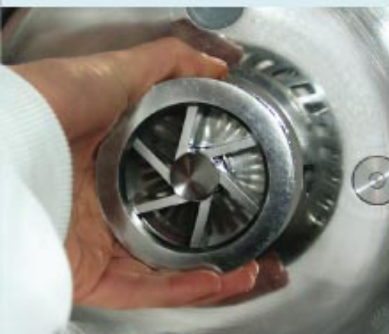
Manual change of the tools.

Melter integrated with the agitator in the tank. Possibility of tipping tank for draining.