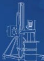
Disperseur sur monte & baisse