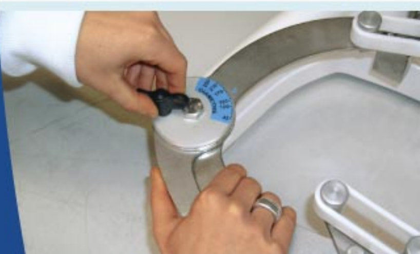
Beakers clamping (patented system)