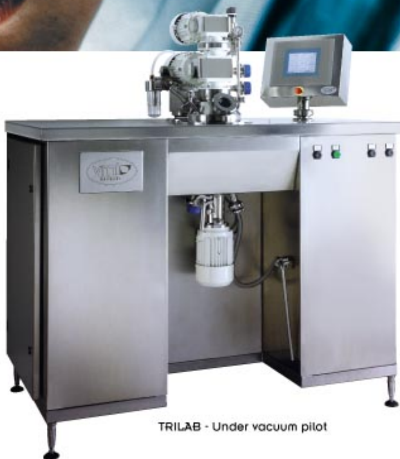
TRILAB - Under vacuum pilot