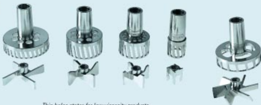
Thin holes stator for low viscosity products