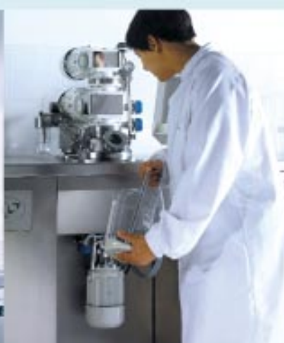
Under vacuum incorporation of powders and liquids in the bowl bottom.