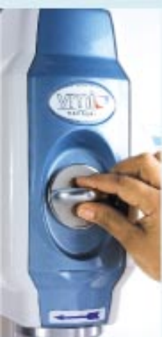
Only one lifting handle (patented system)

The machine is equipped with a large choice of blades. In option: use of an emulsor.