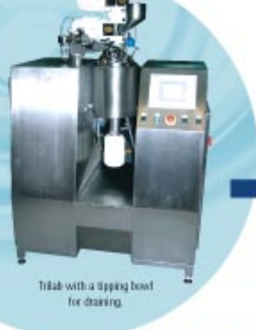
Trilab with a tipping bowl for draining