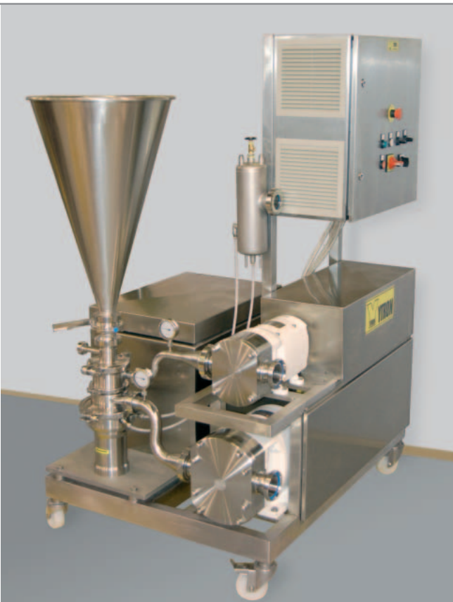
YTRON-ZC ViscoTron for high viscosities and/or high solids ratio