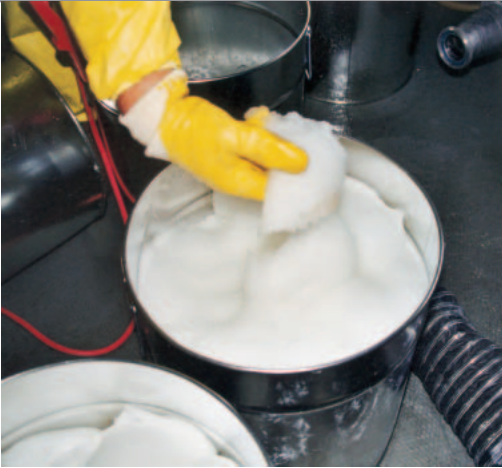
Product example: Carbopol - Concentration approx. 12%