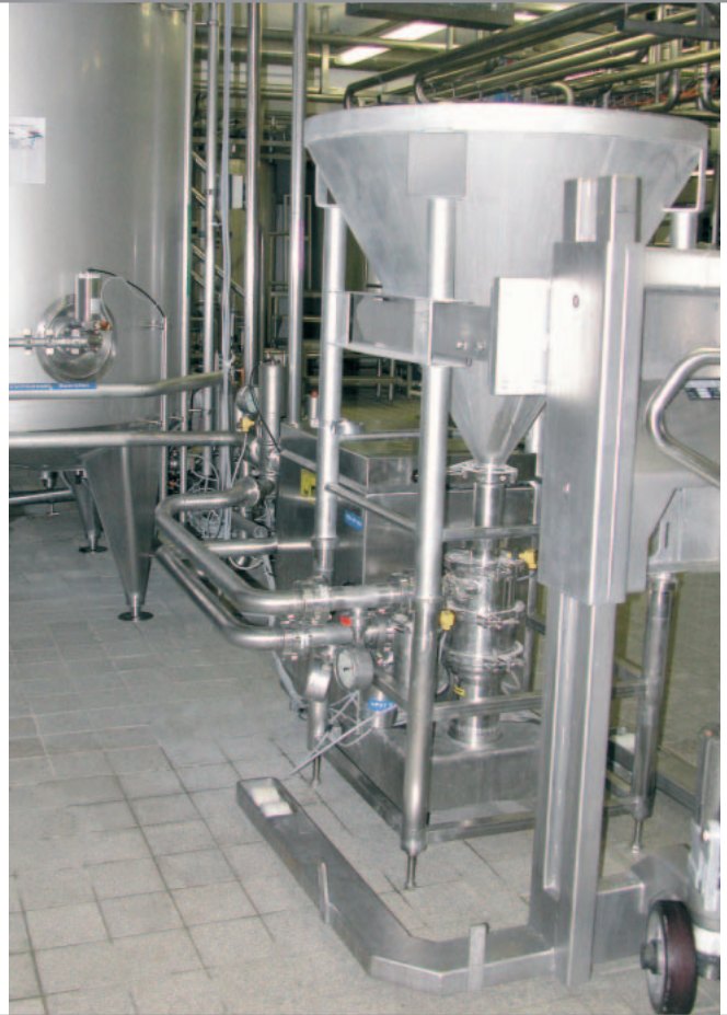
YTRON-ZC in the Dairy Industry Application: Dispersing of a Protein Hydrolysate