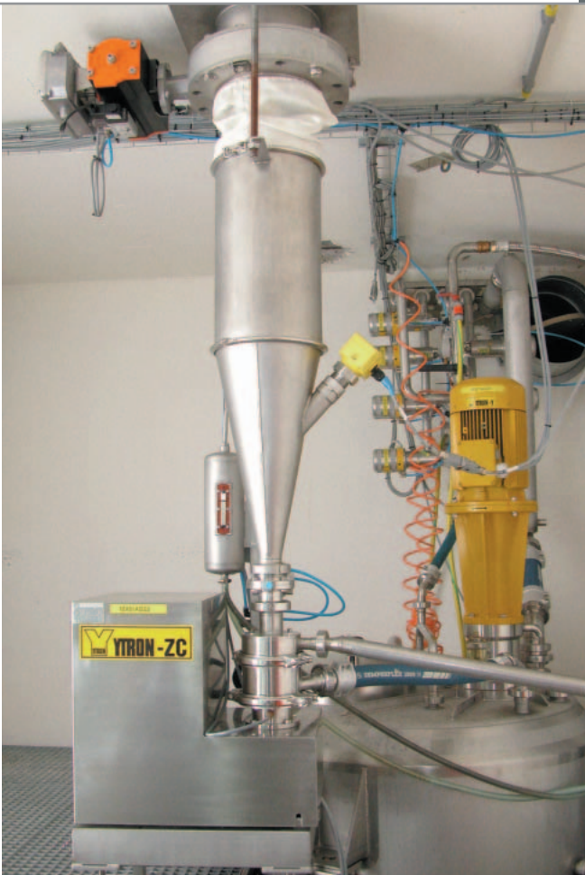
YTRON-ZC with powder addition via silo Application: Suspending of Spices